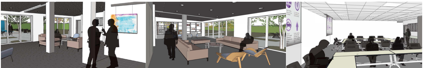
Renderings of our future Memory Cafe and the Large Education Room.